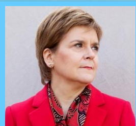
NICOLA STURGEON EXCLUSIVE Q&A